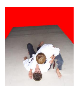
Fig. 2b Moving into Kesa Gatame