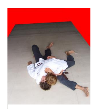
Fig. 2c Kesa Gatame

Then, move into the transitional phase of the lesson. Uke will remain lying down on the mat while Tori, who is in a standing position, grasps Uke's gi sleeve with the hand (Fig. 2a).