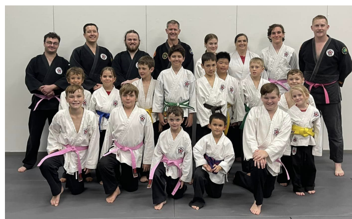
Jujitsu on Tuesday night with pink belts.