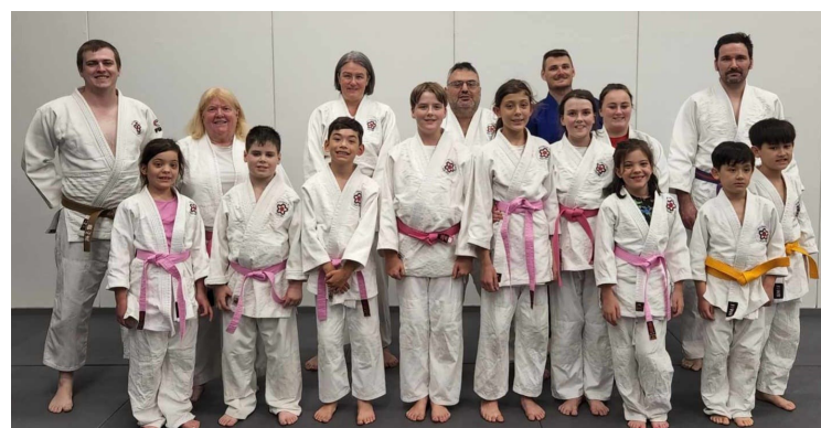
Judo on Monday night with pink belts.

Thank you to those who bought the pink belts for Breast Cancer Awareness Month - October. During the week beginning 16th October we will have a gold coin donation jar on the table, or you can pay by contactless at the table to raise more money for the cause. Just that week only, as 19th October is the day celebrated against breast cancer. Thank you to our School for the donation of $150 passed at the committee meeting last Sunday.